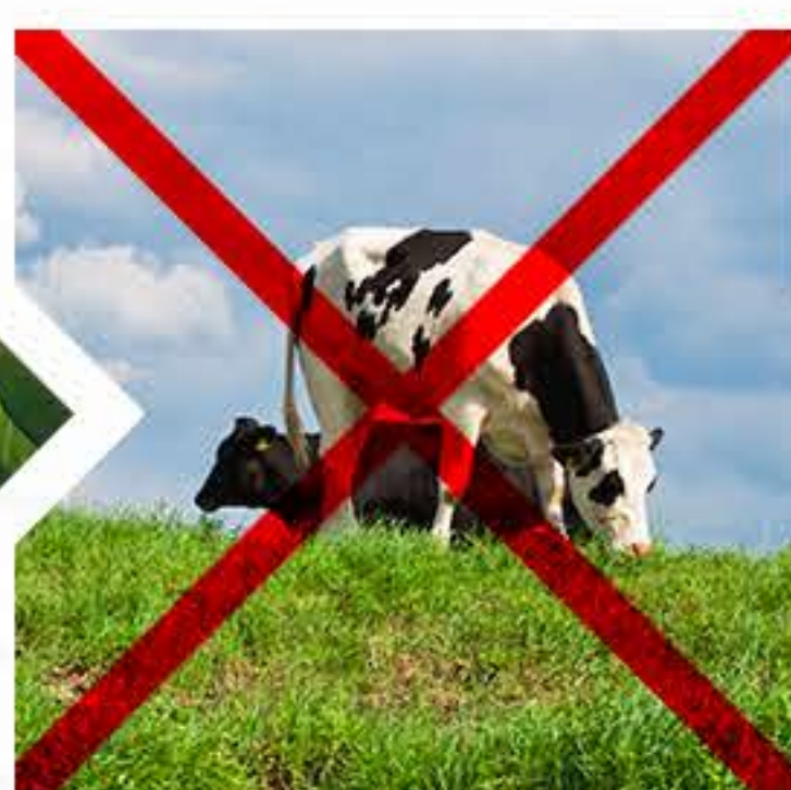
No animal or human origin