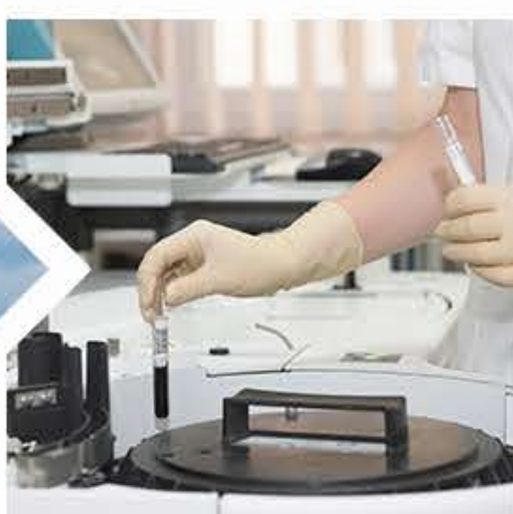
No Transmissible Spongiform Encephalopathy (TSE)