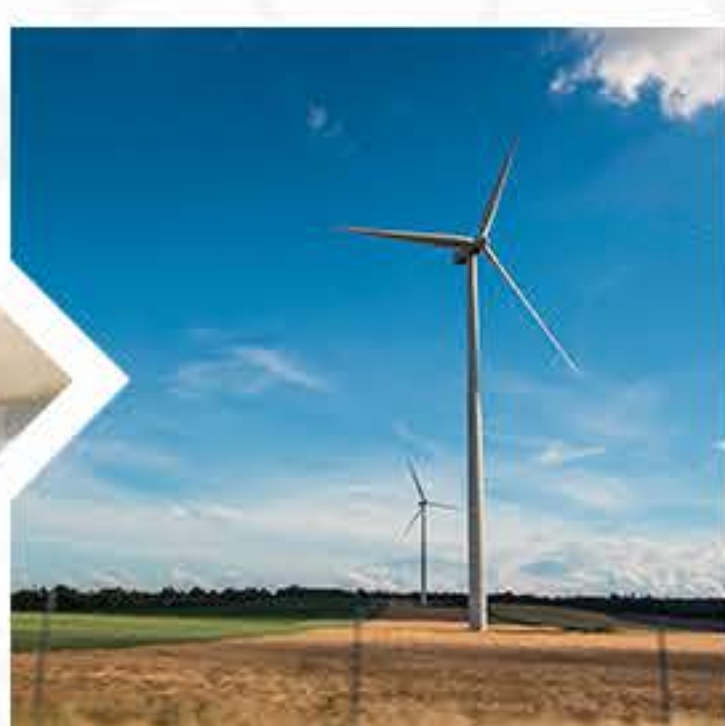
Sustainable production methods