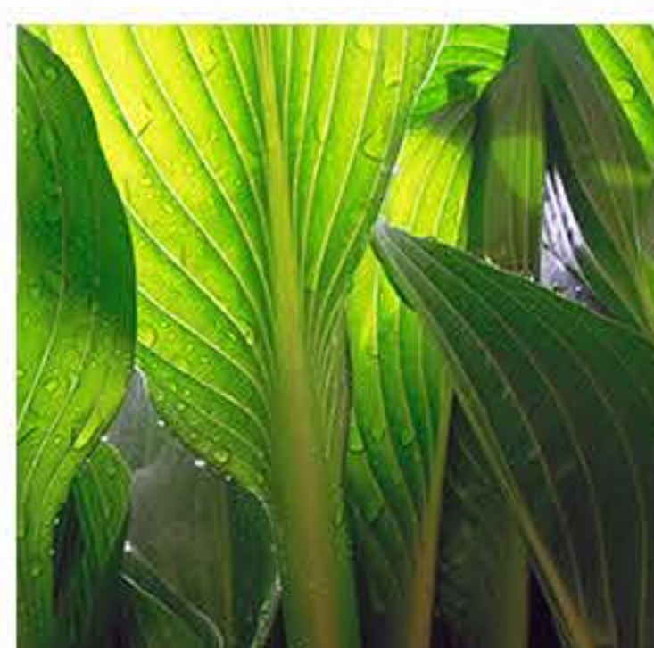
Plant based fermentation

Kyowa was the first to provide unique, innovative fermentation technology which has enabled the production of amino acids on an industrial scale for the very first time.